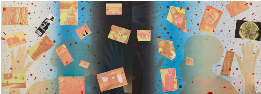
Howardena Pindell Autobiography Past & Present

Offset lithograph 21.5 x 60 inches, 1989