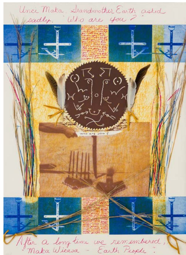
Kaylynn Sullivan TwoTrees, Maka Wicasa , offset lithograph, collage, construction, 30 x 22 inches, 1992